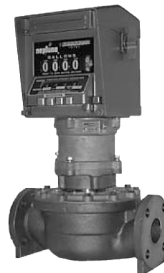
2" Type MP with Model 300 Calibrator and 800 Series Register

The unique design utilizes positive gearing throughout to eliminate slippage inherent in friction drive devices. The external calibrator's variable ratio drive unit mechanism is identical to the mechanism used in the Automatic Temperature Compensator, a dependable product which has been the standard of the industry for more than 30 years.